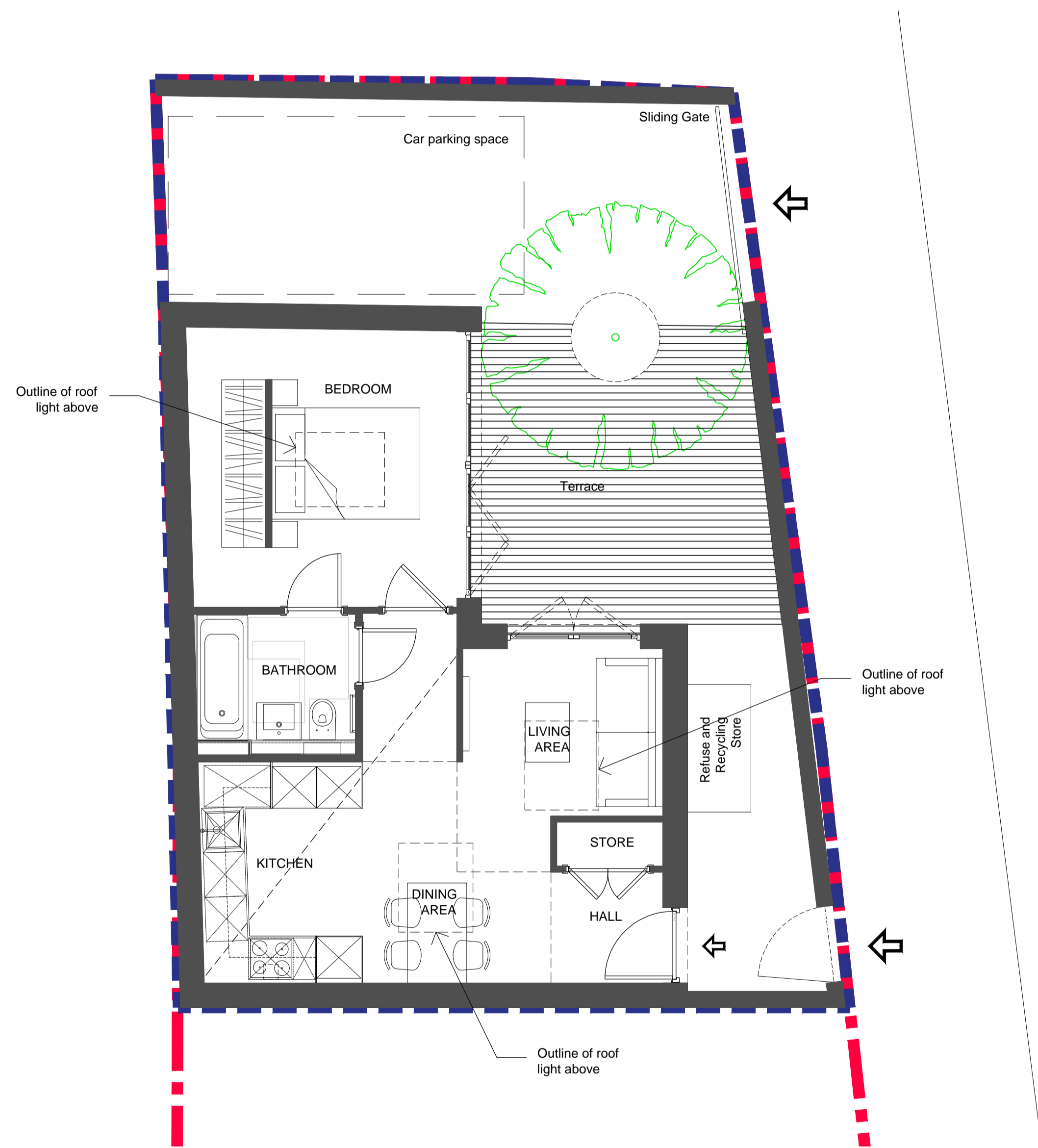
Ground Floor Plan SCALE: 1:50@A1; 1:100@A3