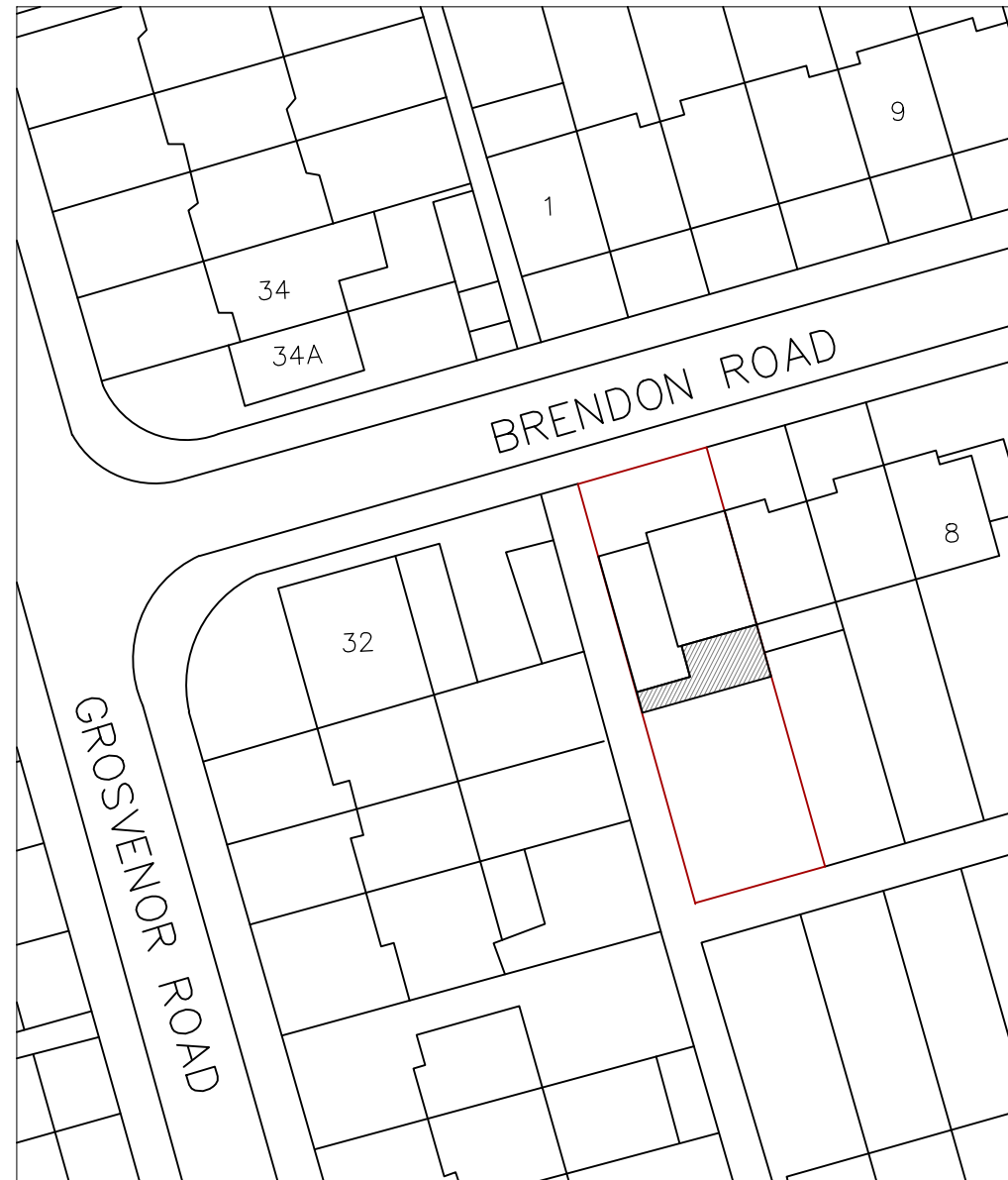
PROPOSED BLOCK PLAN 1:500