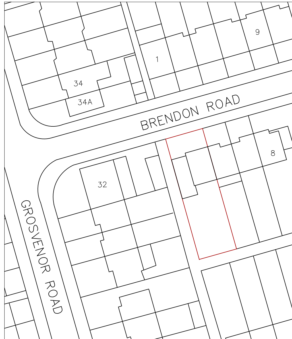
EXISTING BLOCK PLAN 1:500