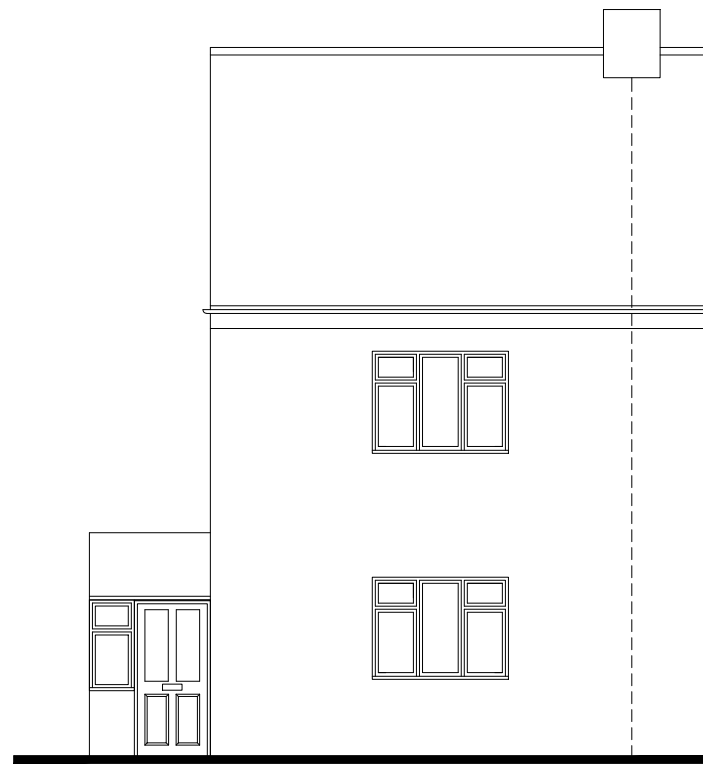
04 FRONT ELEVATION