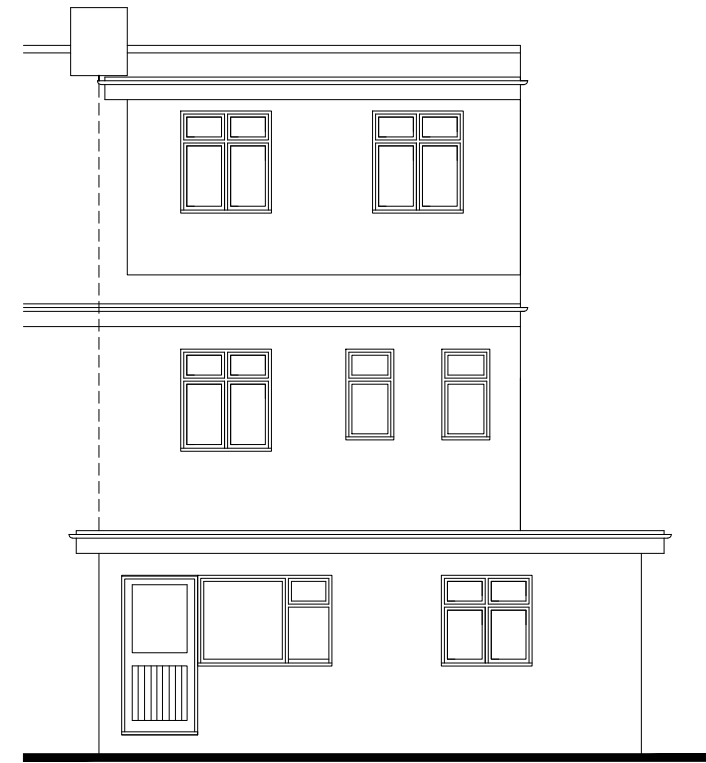
03 REAR ELEVATION