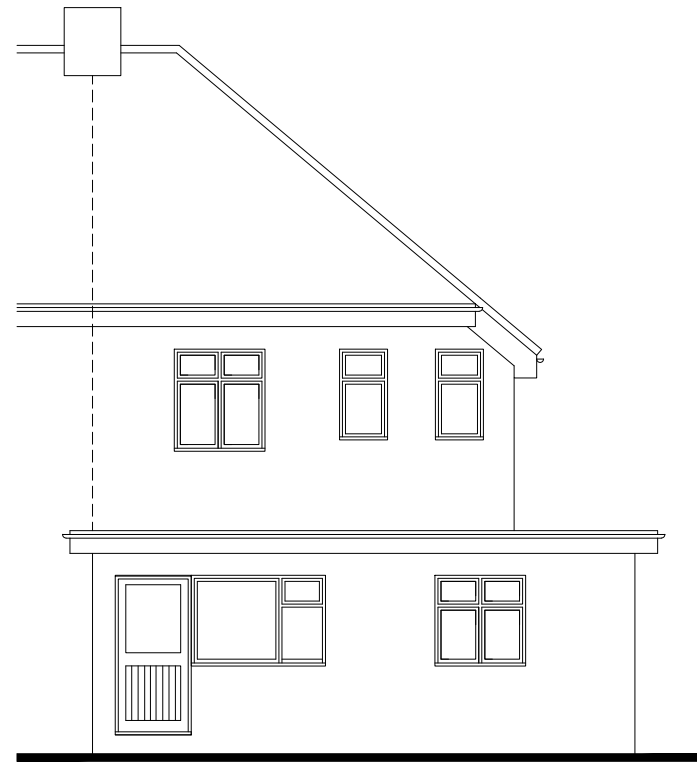
02 REAR ELEVATION