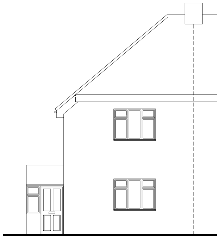
03 FRONT ELEVATION