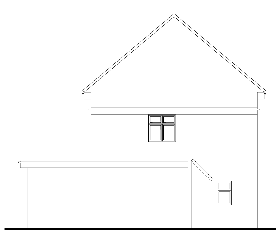
04 SIDE ELEVATION